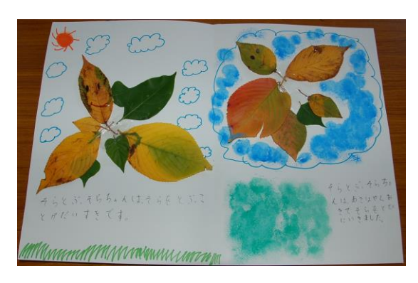
A child's picture book page