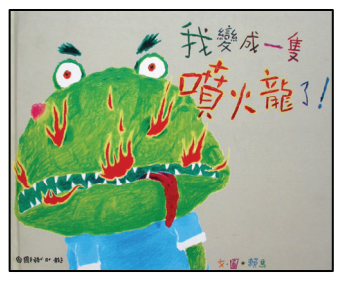
I've Become a fire-Breathing Dragon!, 1996