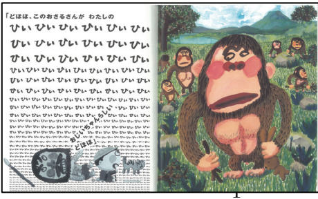
My Grampa's Gramp's Grampa's Grampa, 2000